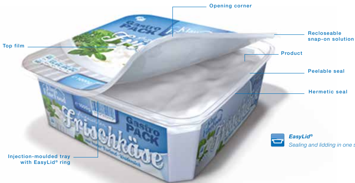
EasyLid® Sealing and lidding in one single step.