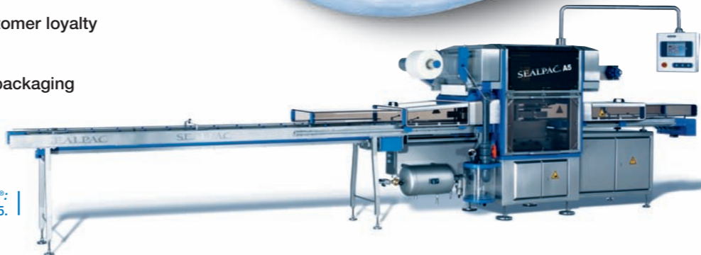
Ideal for bestfresh ®: SEALPAC A5.

The bestfresh ® system is fully compatible with all other SEALPAC machines. A flexible tooling quick release system ensures that SEALPAC packing machines are easy to adapt to special product-shaped packaging.