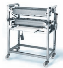
Simple adaptation to bestfresh ® with the SEALPAC tooling quick release system.